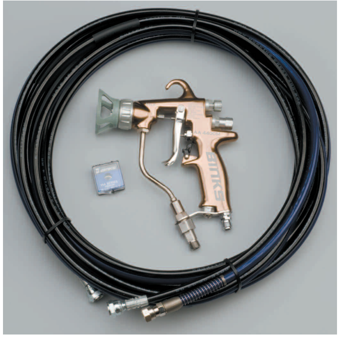
Part number AA4400M-75 AA4400M Air Assisted Airless Spray Gun with air cap, tip and 7.5 metre Air/Fluid Hose for use with standard Binks MX & HP pump outfits.